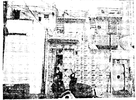
PHOTO OF THE PROPERTY

E-Auction Website: https://BAANKNET.COM/